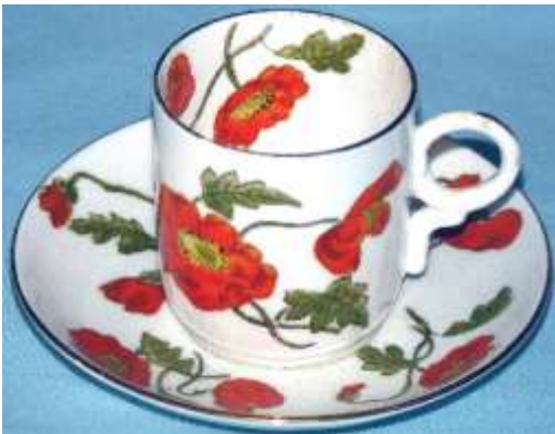
309A. Cup and saucer

Cromer poppies on both, and with a distinctive agent’s stamp to the base of both 10