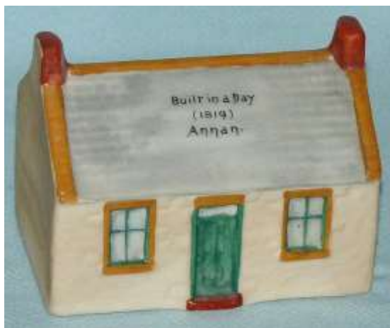
76. Built in a Day House Annan